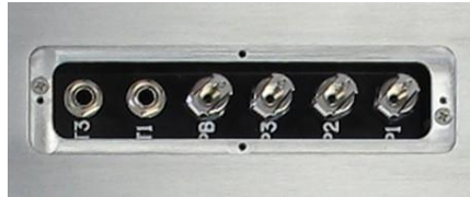
Model 620 Calibration Ports