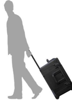
On Wheels for Easy Relocation