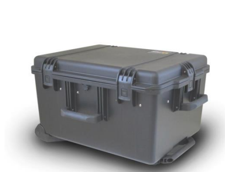
Model 620 Box Closes for Transport

The Model 620 offers two flow ports and fixture air regulator comparable to the larger machines.