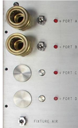
Model 620 Flow Ports

The Model 620 offers two flow ports and fixture air regulator comparable to the larger machines.