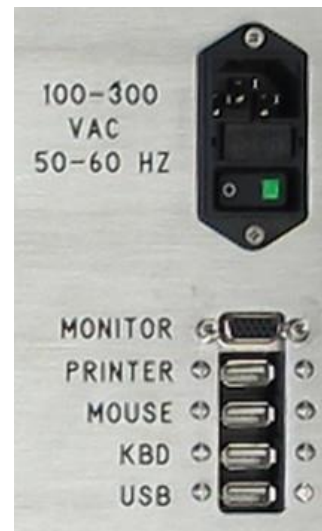
Electronics Interface Access